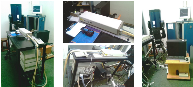
Fig. 1. Elastic backscatter lidar system developed at IPB.

The first elastic backscatter lidar system at the IPB was developed in 2008 as bi-axial lidar system with transmitter unit based on a water-cooled, pulsed Nd:YAG laser, emitting pulses of 100 mJ and 50 mJ output energy at 1064 and 532 nm respectively, with a 20 Hz repetition rate (Fig .1). The optical receiver was the Schmidt–Cassegrain telescope with a primary mirror of 304.8 mm diameter. Si PIN photodiode FD5N was used to detect elastic backscatter lidar signal at 532 nm. An interference filter with 3 nm bandwidth was used to select the lidar wavelengths and to reject the atmospheric background radiation during daytime operation. For analog detection, the signal was amplified according to the input range selected and digitized by an A/D converter NI5124.