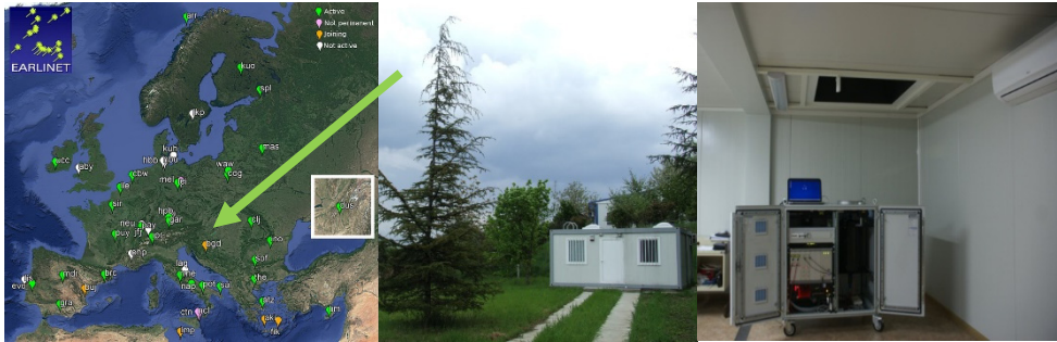
Fig. 2. IPB Raman EARLINET joining lidar station.

elastic backscatter lidar is operational both at day and night, the Raman lidar is mainly used during nighttime, due to the strong daylight sky background. The determination of the particle extinction coefficient from molecular backscatter signals is rather straightforward since neither lidar ratio nor other critical assumptions are needed (Kovalev, 2015).