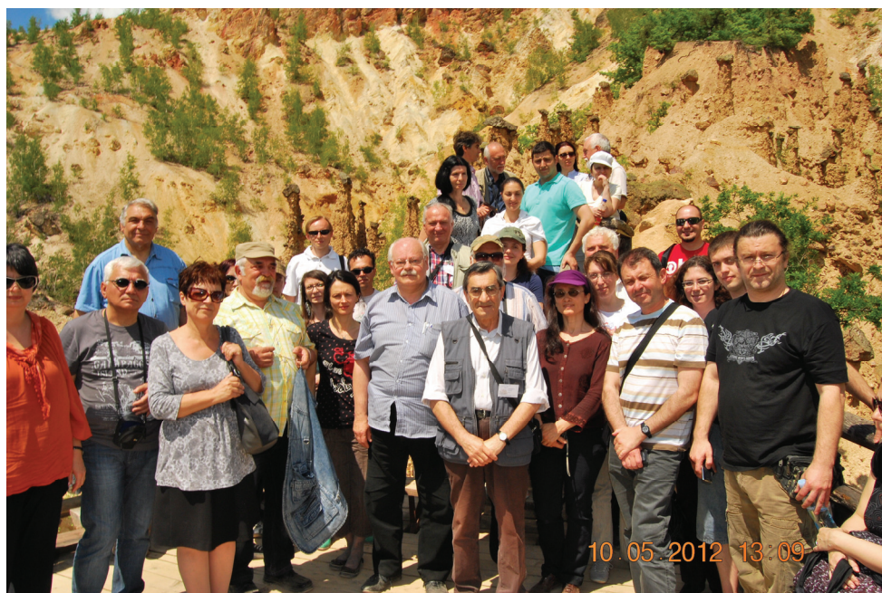
Figure 4. In Devil's town.