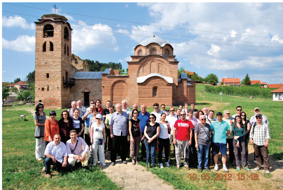
Figure 3. In front of St. Nicholas church in Kuršumlija.