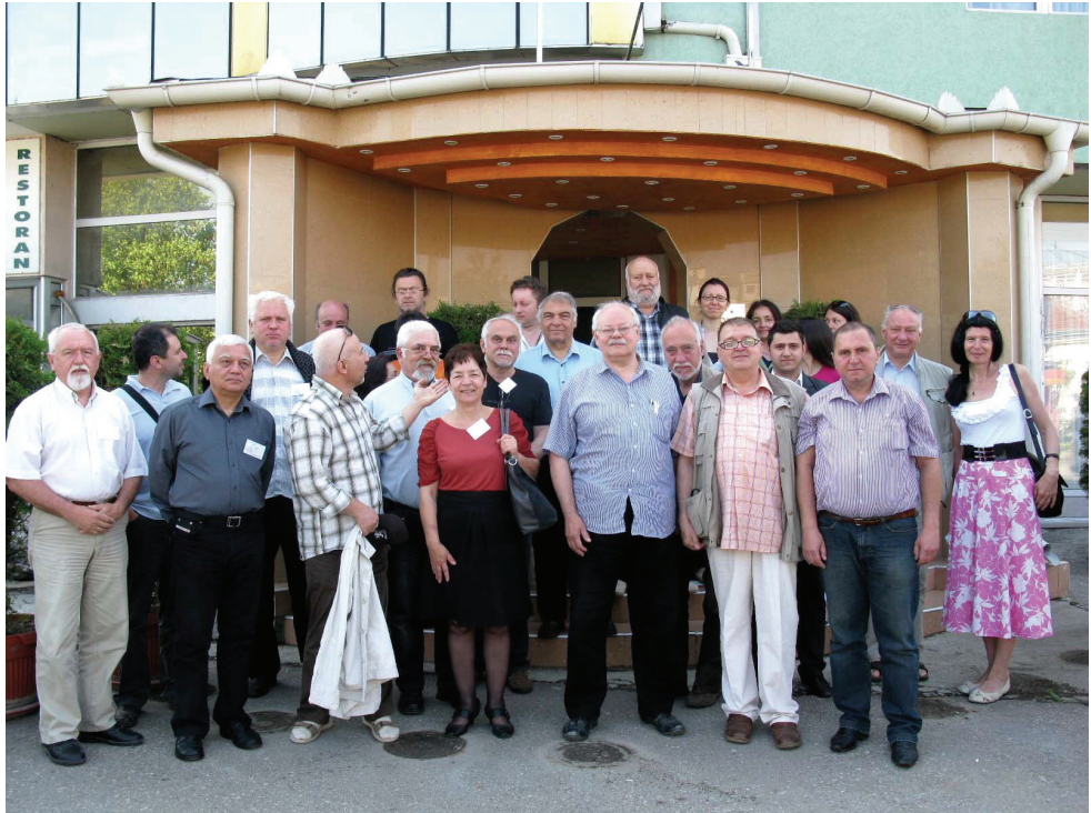
Figure 1. Conference photo.